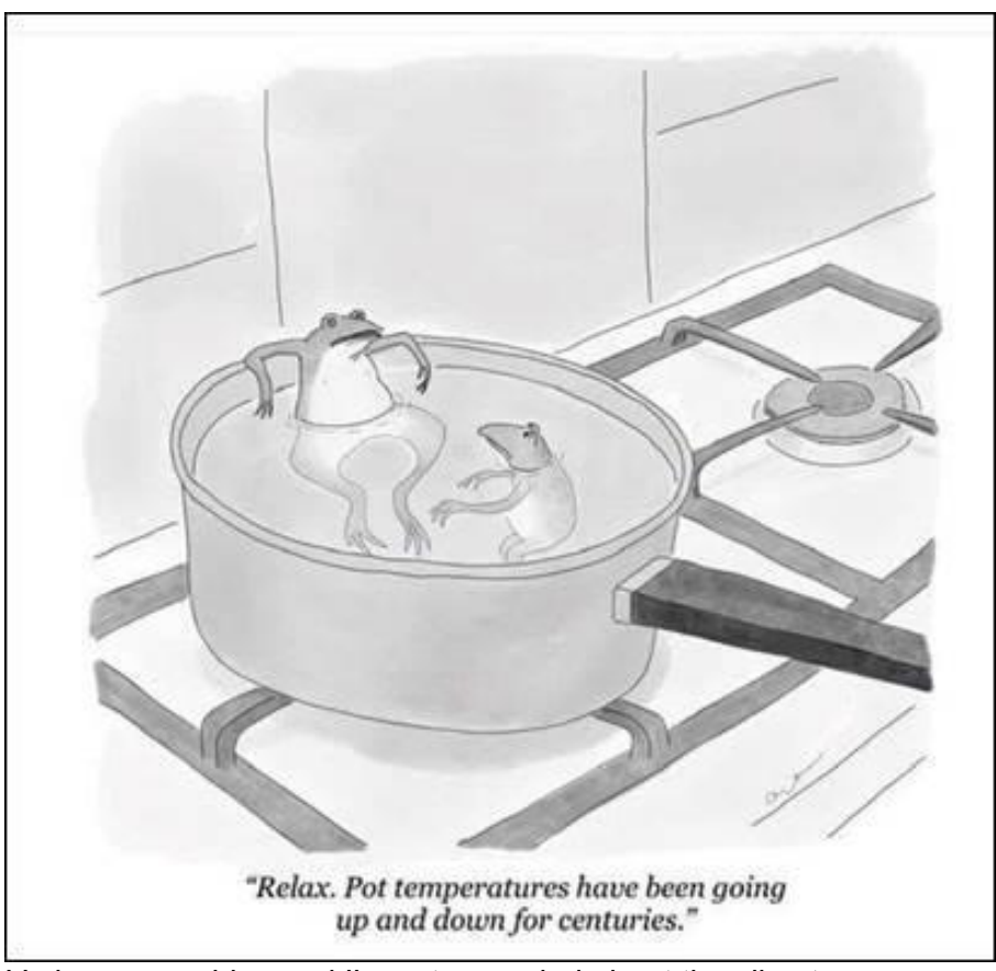
It's been scorching and I'm extra worried about the climate.